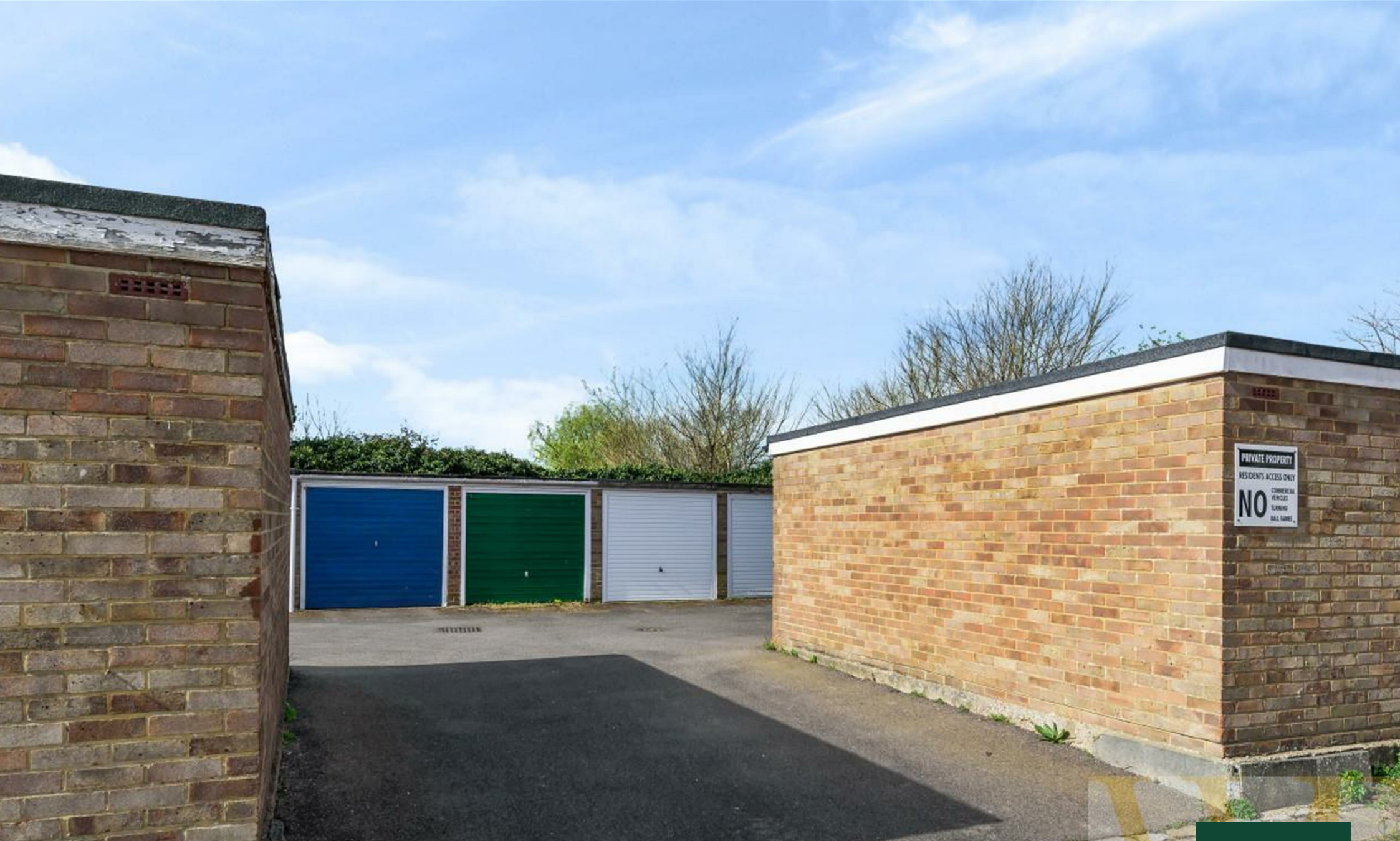
Garage No: 20 Overmead | | Shoreham-By-Sea | BN43 5NS